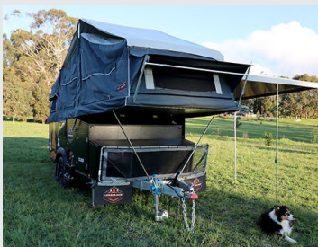
Spacious Cabin Tent with Extra High Roof for Airflow