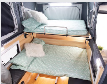
Lounge Which Converts to Another Sleeping Space