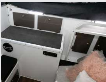
Interior Storage Cupboards