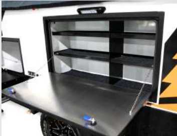
Large Exterior Pantry Storage & Preparation Bench