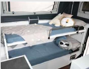
Twin Bunk Beds which convert to a sofa