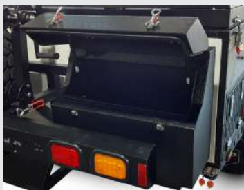
Rear Lockable Toolbox For Easy Tool Access.