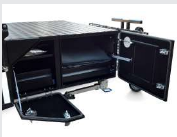
Plenty of Storage Options