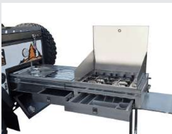
Luxury Cooking Facilities