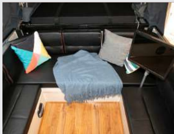
Lounge area that converts into another spacious bed