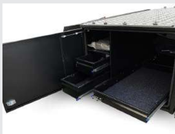
Plenty of Storage Options