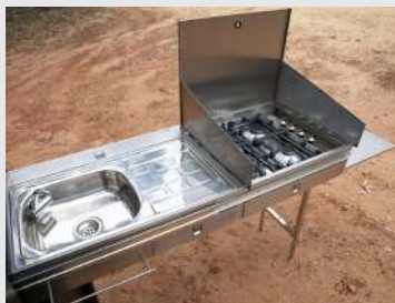
Luxury Cooking Facilities