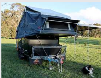
Spacious Cabin Tent with Extra High Roof for Airflow