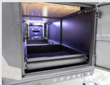
Large Dedicated Fridge Storage Space in Front Toolbox