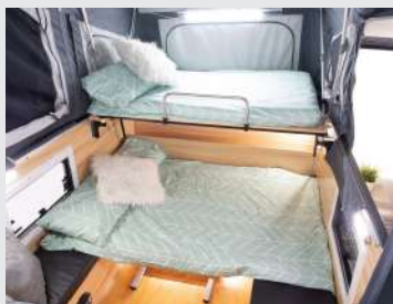
Lounge Which Converts to Another Sleeping Space