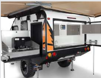
Full Cooking facilities at rear as well as storage space