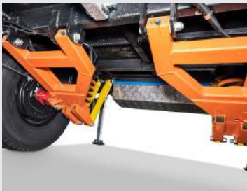
Independent Suspension & off road ready