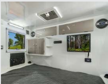
Internal Multimedia System, 17" Monitor, Dual Speakers & Storage