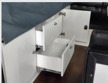
Multiple Interior Storage Cupboards & Drawers