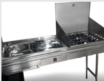
Full 4 Burner Cooker & Sink with Hot & Cold Facility