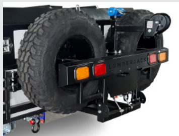
Two Spare Tyres included On Rear Drop Down Support