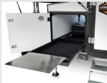
Large Fridge Slide with Fold Out Utility Bench