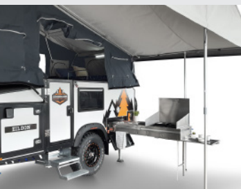
Setup the Included Annex for an Under Cover Entertainment Space