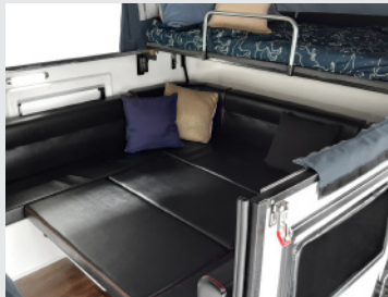
Lounge Which Converts to Another Sleeping Space

FORWARD FOLDING HARD FLOOR WITH SINGLE BUNK BED