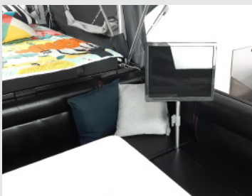
17 Inch LCD / LED Monitor & Multimedia player