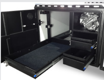
Plenty of Storage Options