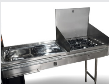
Luxury Cooking Facilities