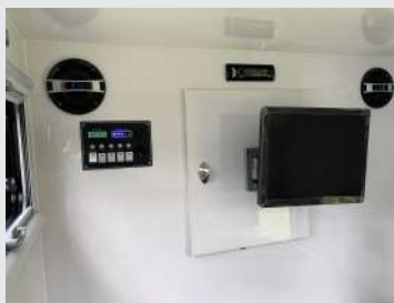
Internal multimedia system with 17 inch LED Monitor