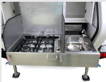
Full Kitchen with 4 burner cooker at rear