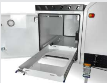
New designed front toolbox for storing a camping fridge