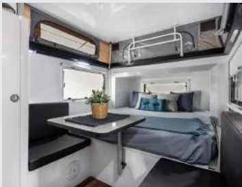
Spacious Interior with Dining Suite & Swing Away Table