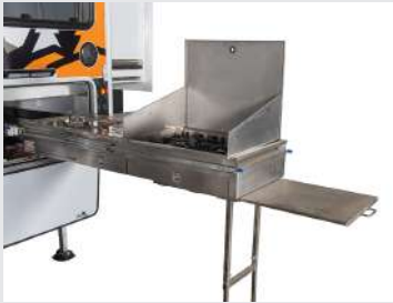
Exterior Stainless Steel Kitchen Slide with 4 Burner Cooker