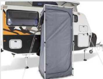
External Shower Outlet & Ensuite Tent Included