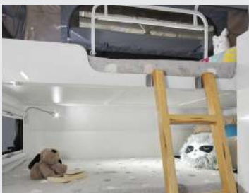
Twin bunks up the front make sleeping the little ones easy