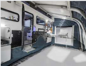
Add on an inflatable annex to create an extra living space

SOFT TOP HYBRID CARAVAN WITH SLIDE OUT BED & DUAL BUNK BEDS