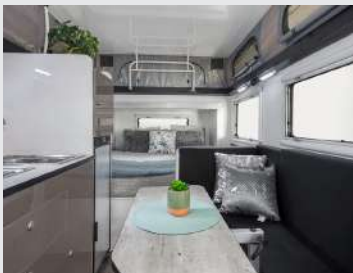
Neat layout which makes use of every space for seating or storage