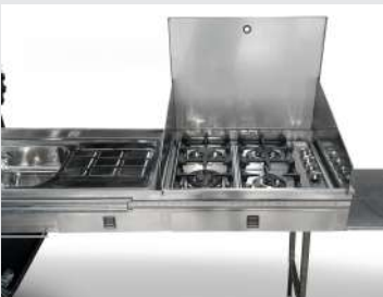
Luxury Cooking Facilities