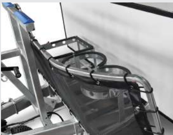
Easy Access Gas Bottle & Jerry Can Holders

FORWARD FOLDING HARD FLOOR WITH REAR SLIDE OUT BED