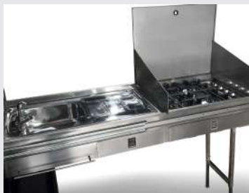
Full 4 Burner Cooker & Sink with Hot & Cold Facility