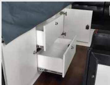
Multiple Interior Storage Cupboards & Drawers