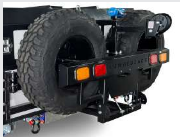
Two Spare Tyres included On Rear Drop Down Support