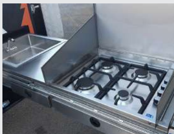
Full 4 Burner Cooker & Sink with Hot & Cold Facility