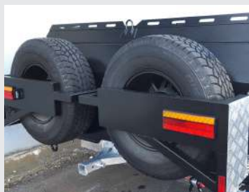
Cooper Tyres With Two Spares Included Keeps You Rolling