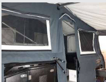
Full Exterior Annex Included With Ensuite Room