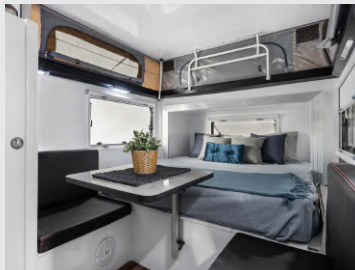
Spacious Interior with Dining Suite & Swing Away Table