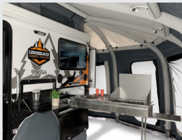
Optional Exterior Inflatable Annex For Dining Outside