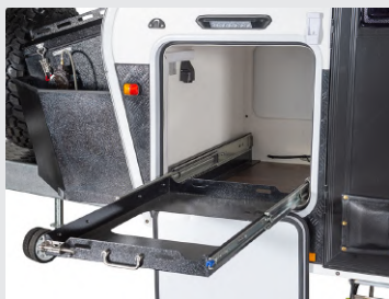
Dedicated Fridge Storage Slide with Power Supply