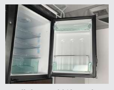
Installed Internal fridge & Plenty of Bench Space