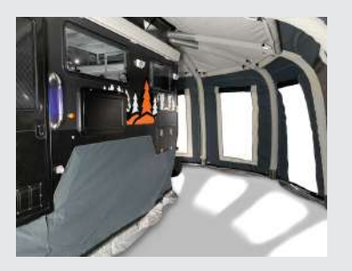
Add on an inflatable annex to creat an extra living space

The family sized hybrid caravan for families up to four who love to get outdoors!