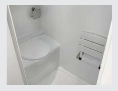
Interior bathroom with toilet & Shower for total convenience