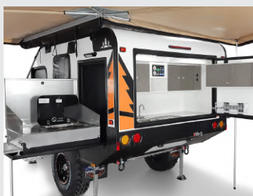
Full Cooking facilities at rear as well as storage space