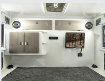
Internal Multimedia System, 17" Monitor, Dual Speakers & Storage