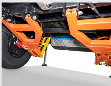
Independent Suspension & off road ready