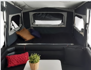
Rear Slide Out Bed Perfect for the Little Campers