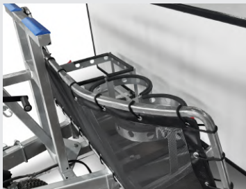
Easy Access Gas Bottle & Jerry Can Holders

FORWARD FOLDING HARD FLOOR WITH REAR SLIDE OUT BED