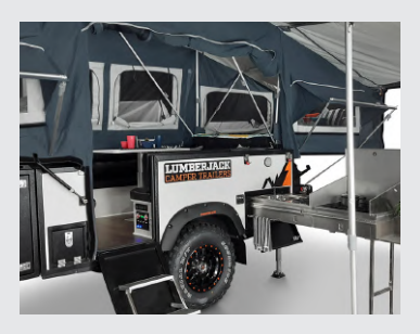
Huge Exterior Living Space