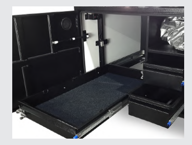
Plenty of Storage Options