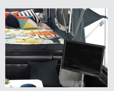
17 Inch LCD / LED Monitor & Multimedia player