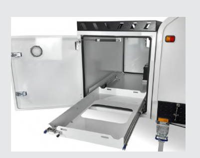
New Larger Front Toolbox With Dedicated Fridge Slide