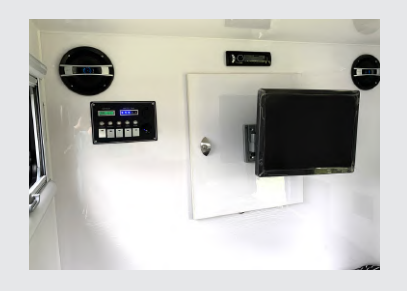
Internal multimedia system with 17 inch LED Monitor