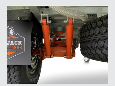
Independent Suspension for a Smooth Tow on or off road