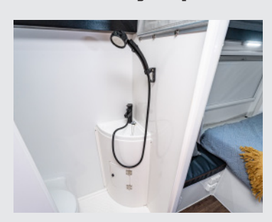
Interior Ensuite Room with Cassette Toilet & Shower