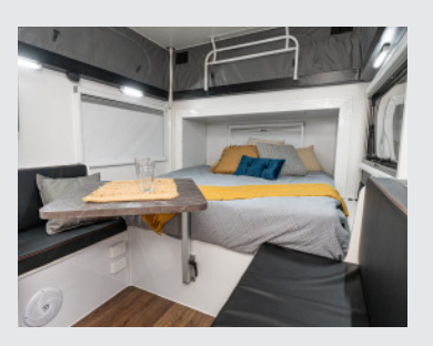
Spacious Interior with Dining Suite & Swing Away Table