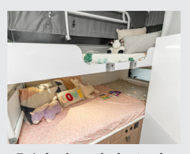
Twin bunks up the front make sleeping the little ones easy

POP TOP HYBRID CARAVAN WITH SLIDE OUT BED 8 DUAL BUNK BEDS