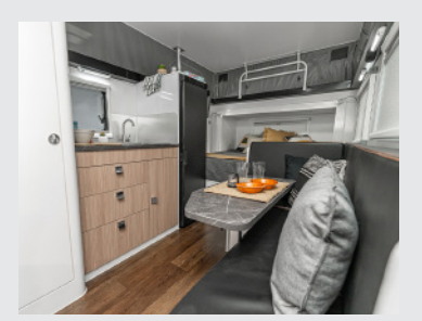
Neat layout which makes use of every space for seating or storage