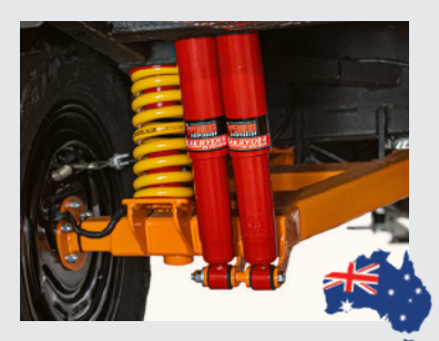
Australian Made & Engineered Suspension System