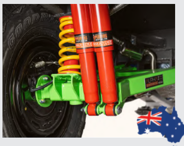
Australian Made & Engineered Suspension System