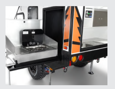
Full Cooking facilities at rear as well as storage space