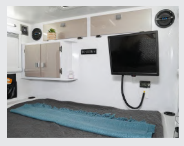
Internal Multimedia System, 17" Monitor, Dual Speakers & Storage