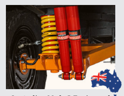
Australian Made & Engineered Suspension System