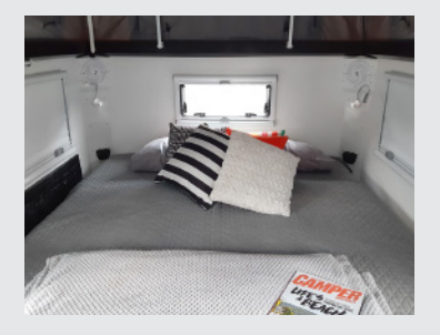
Queen sized main bed with no fold or slide out function required