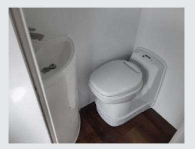
Freestanding Toilet & separate shower room in the ensuite