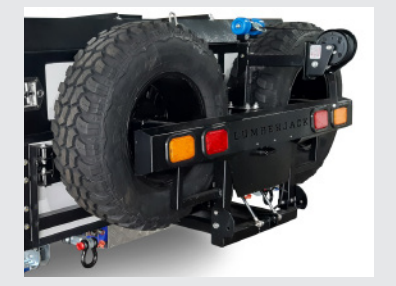
Two Spare Tyres included On Rear Drop Down Support