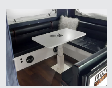
Large Seating Space Converts to Double Bed Area